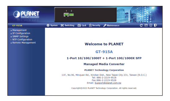
Figure 2. Web Main Screen of Managed Media Converter

After entering the user name and password, the Web main screen appears as in Figure 2 after the login.